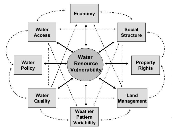
Figure 1. Schematic of linkages (solid arrows) and interactions (dashed arrows) related to changes in the vulnerability of water resources in India due changes in the Indian Monsoon (modified from Pielke [2004]).

time step and a spatial resolution of 30 minutes (0.5 decimal degrees, latitude by longitude). The model was forced by a gridded climatology of observations [ New et al. , 1998] and used two land cover data sets: a pre-agricultural land cover [ Melillo et al. , 1993] and a contemporary land cover. The contemporary land cover was represented by overlaying estimated percentages of rain-fed, irrigated and fallow